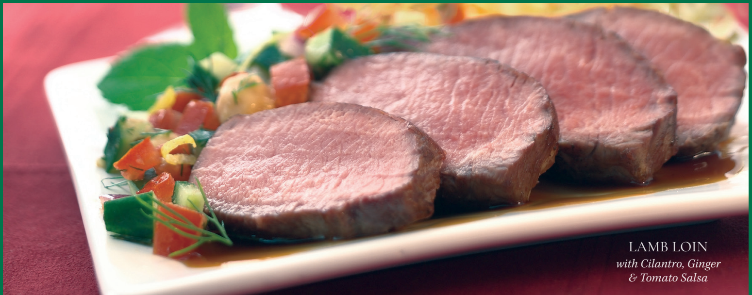
LAMB LOIN with Cilantro, Ginger & Tomato Salsa