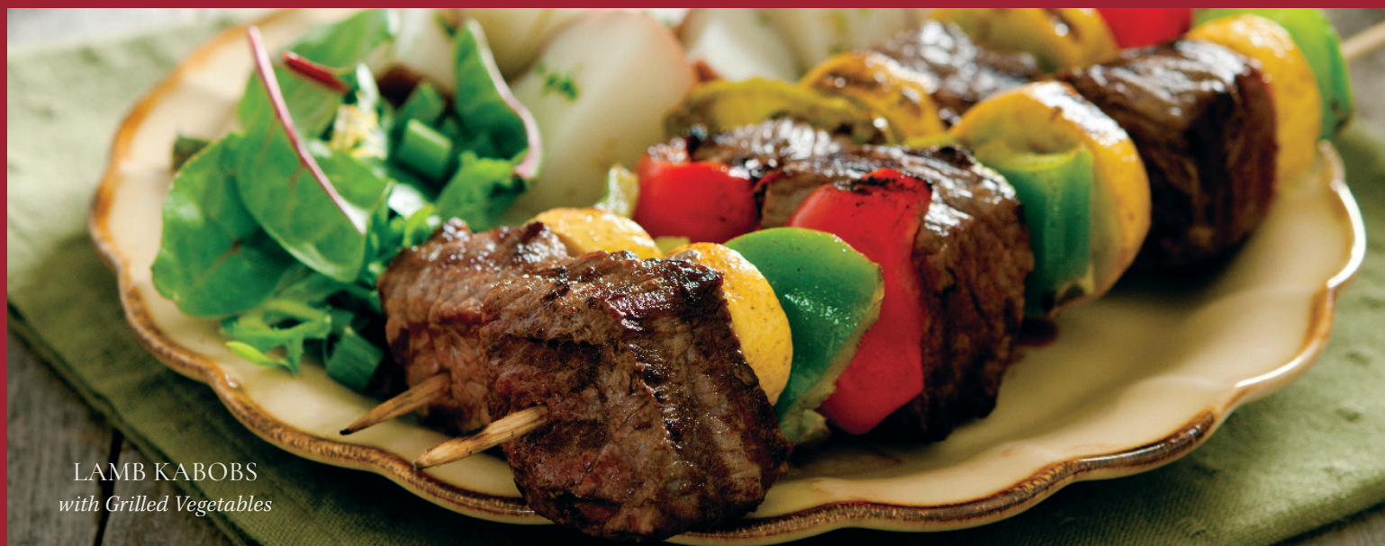
LAMB KABOBS with Grilled Vegetables