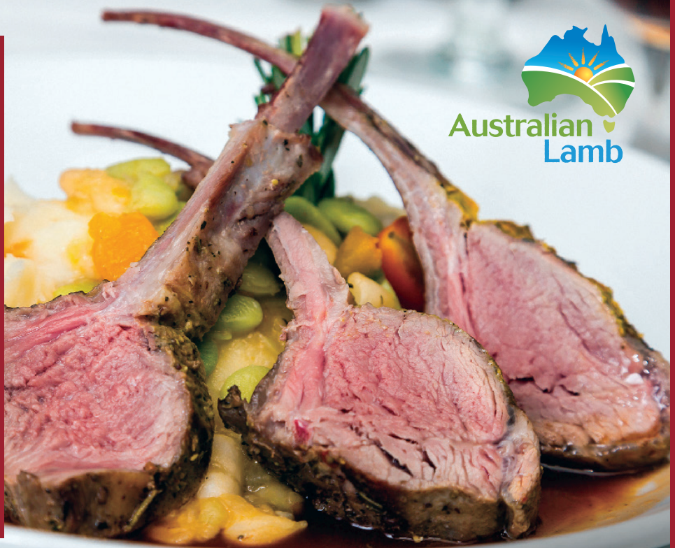
LAMB RIB CHOPS atop Tropical Salsa