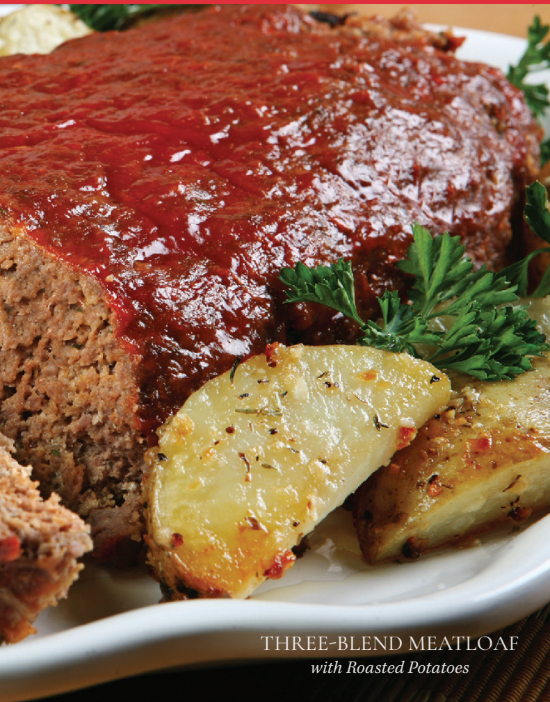
THREE-BLEND MEATLOAF with Roasted Potatoes