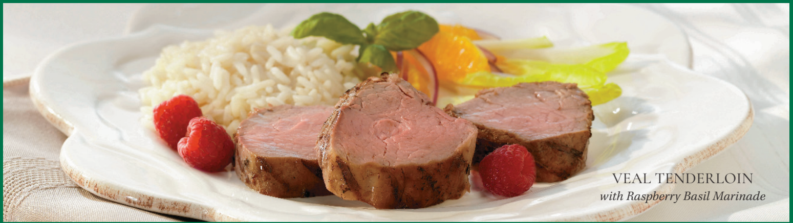
VEAL TENDERLOIN with Raspberry Basil Marinade