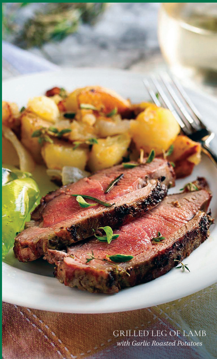
GRILLED LEG OF LAMB with Garlic Roasted Potatoes

Selected USDA Choice lamb leg, trimmed, boned and butterflied. Recipes on bag. 2.25 lb. average. Packed 6 pieces per case.