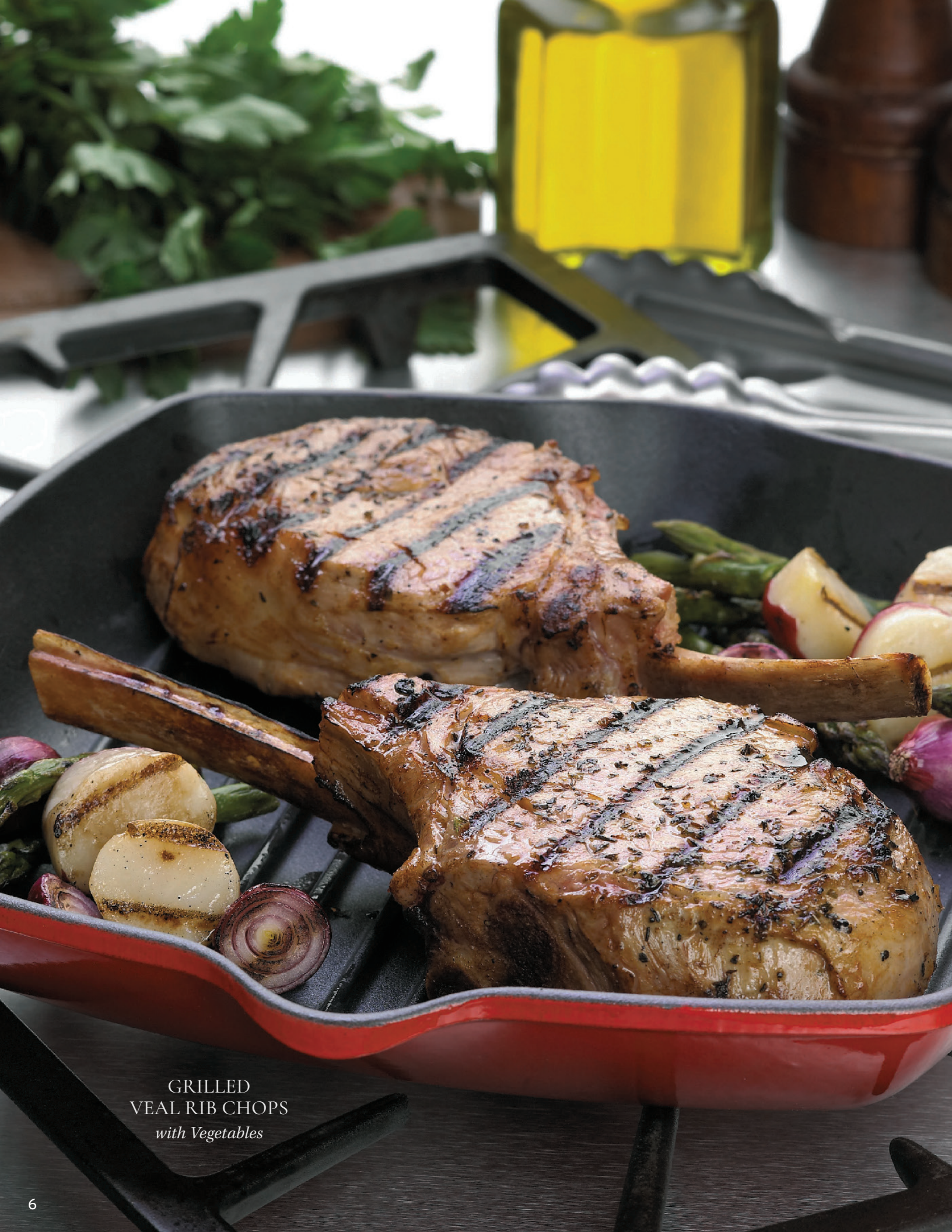
GRILLED VEAL RIB CHOPS with Vegetables